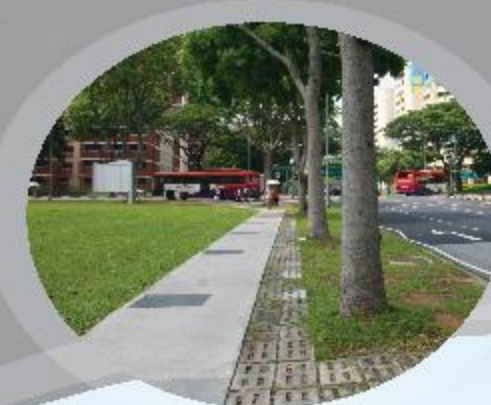
Existing sidewalk along Upper Serangoon Road 位于实龙岗路上段的行人走道