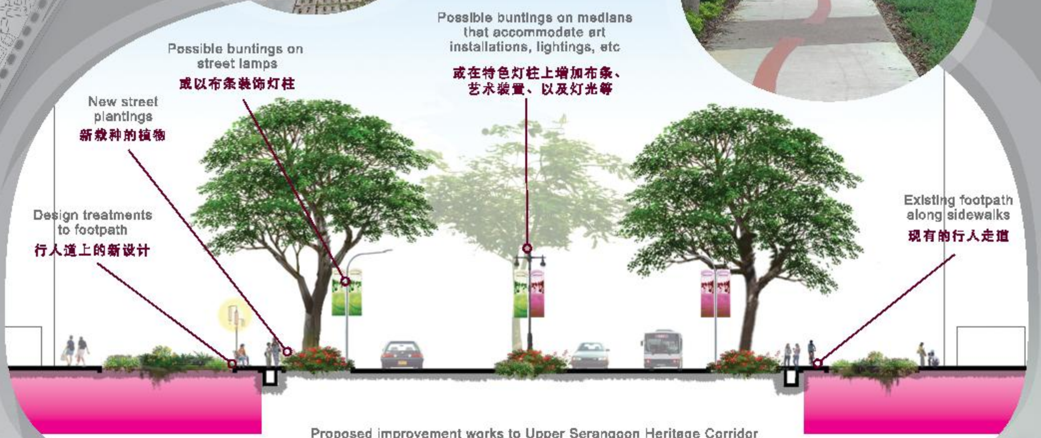
Proposed improvement works to Upper Serangoon Heritage Corridor 实龙岗路上段文化遗产长廊拟议改良工程