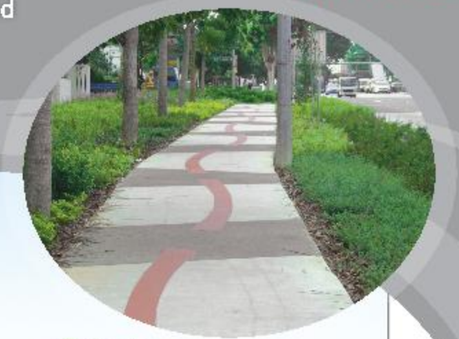
Example of completed sidewalk with landscaping 新的行人走道与景观设计